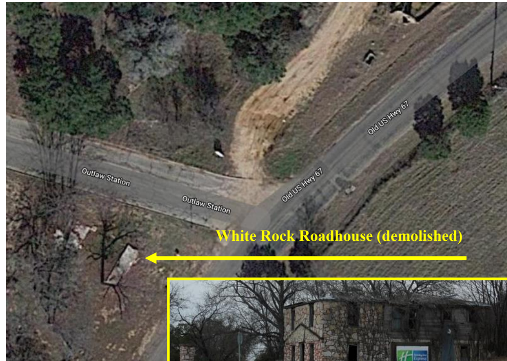
White Rock Roadhouse (demolished)