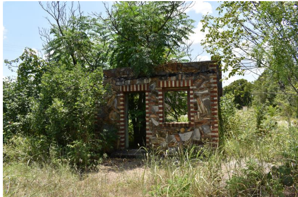
This is the back door.