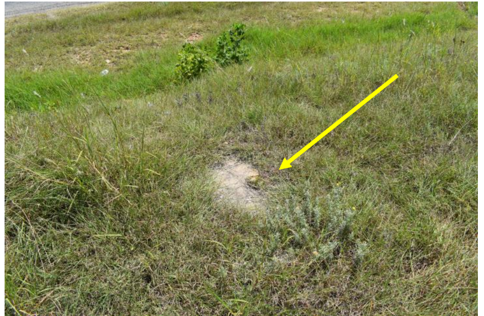
This is all that is left of what was likely a sign post.