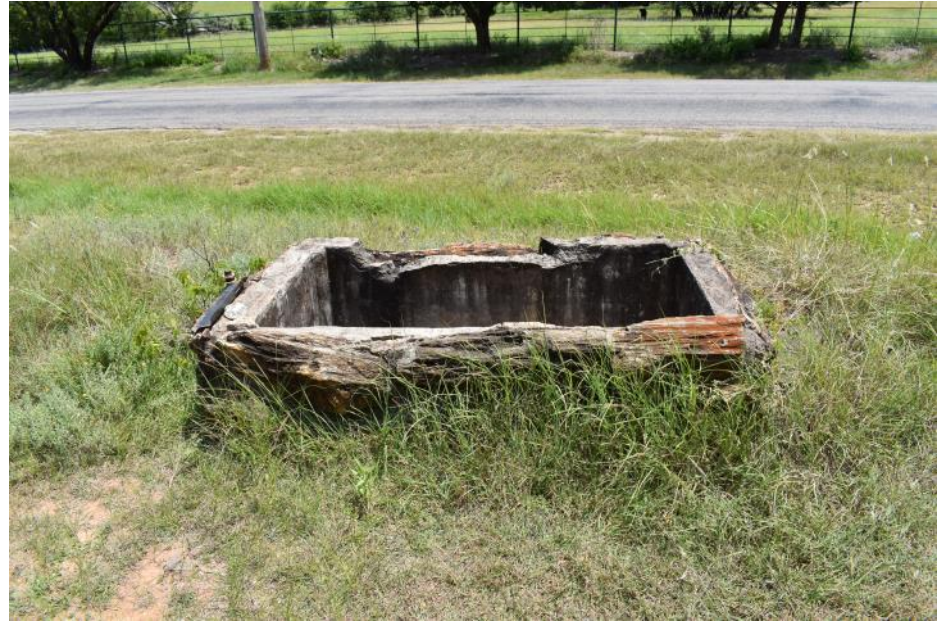
Not sure what this was, but it has old pipes for water possibly.