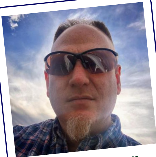
Producer, RG de Stolfe

I started these broadsheets as a means to reduce the number of pages for the regular journal issues. (And let's face it, you don't have time to read 50+ pages of the regular journal when not every topic in them might be of interest to you!) My broadsheets are single topics of special interest in a horizontal page format and restricted to ten pages or less (usually).