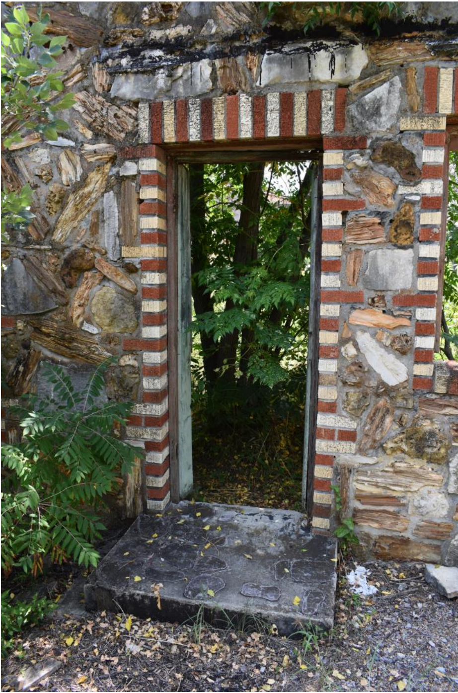
Close up of the back door. Imagine all of the secret liquor smuggling through this door during Prohibition!