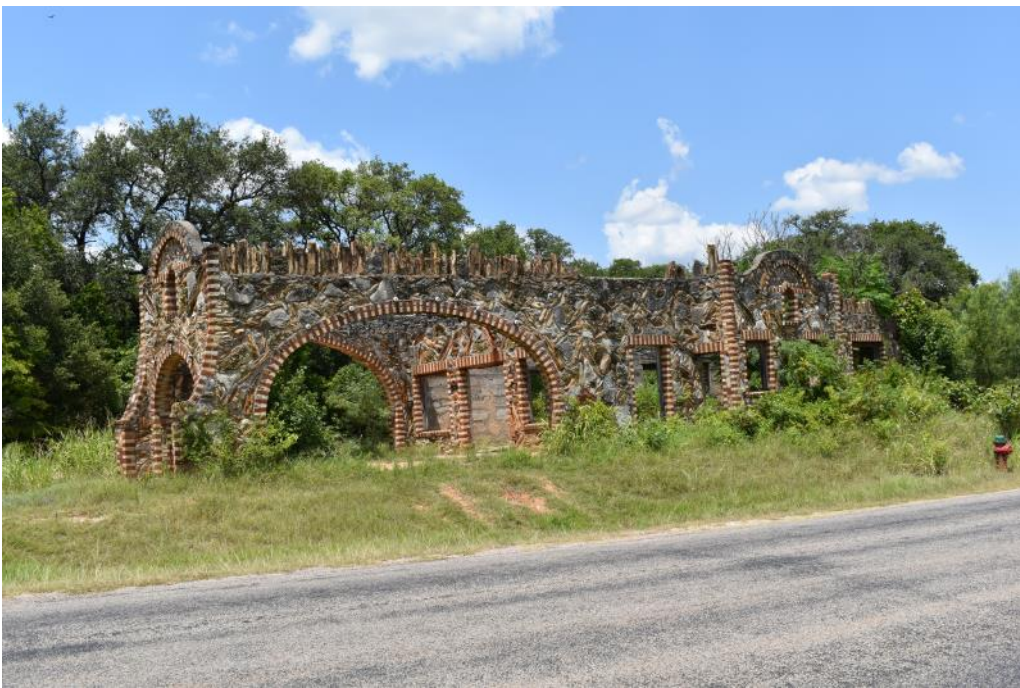
Looking from the southeast.