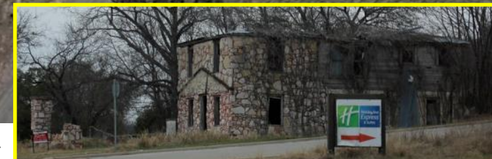
Not RG photo.