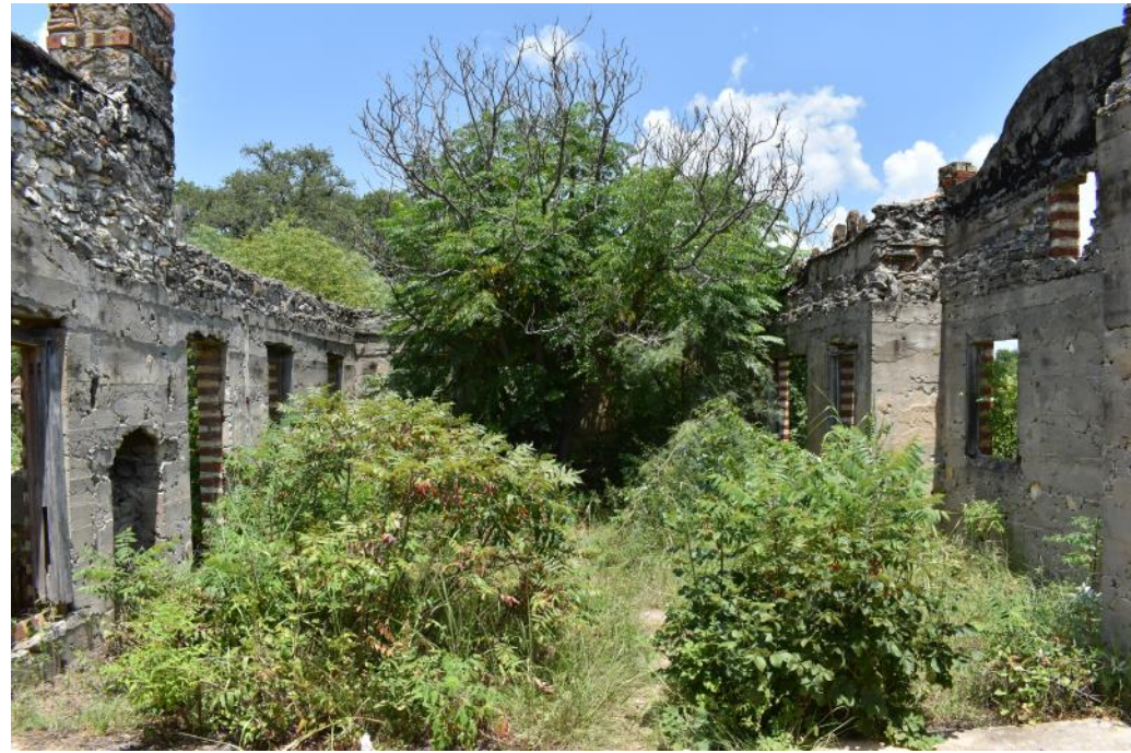
The inside of the building has sadly been let go and overgrown.