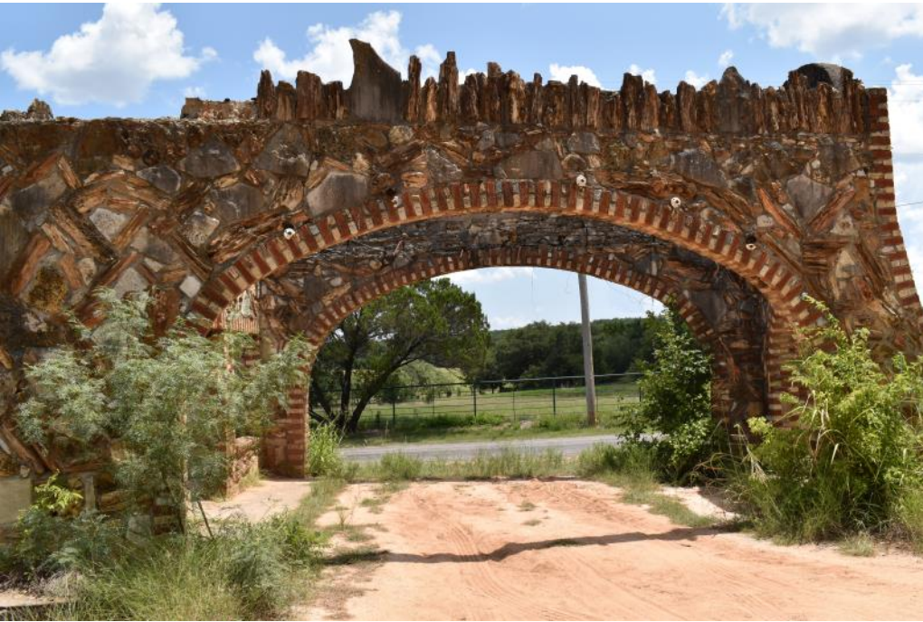
Drive through from the west.