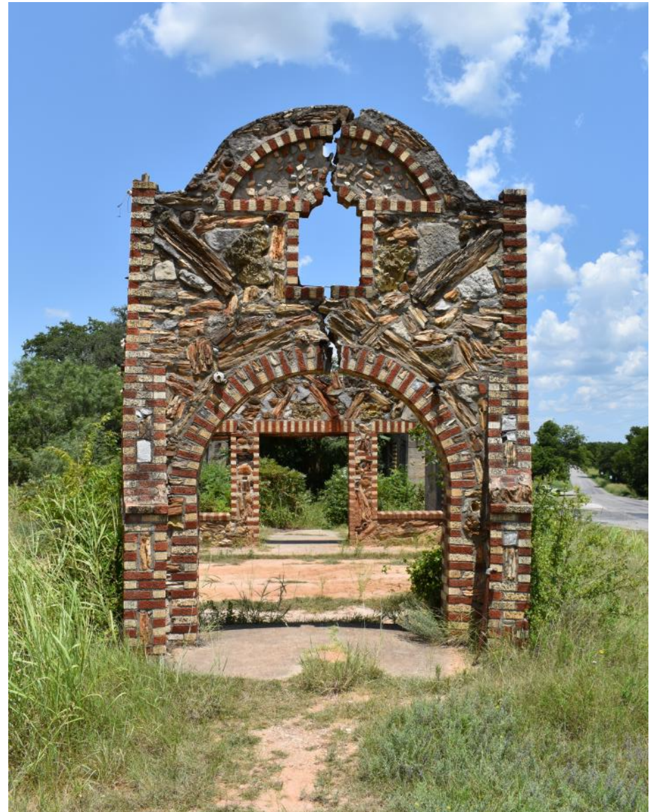
Very front of the building. The large crack developed in recent years.