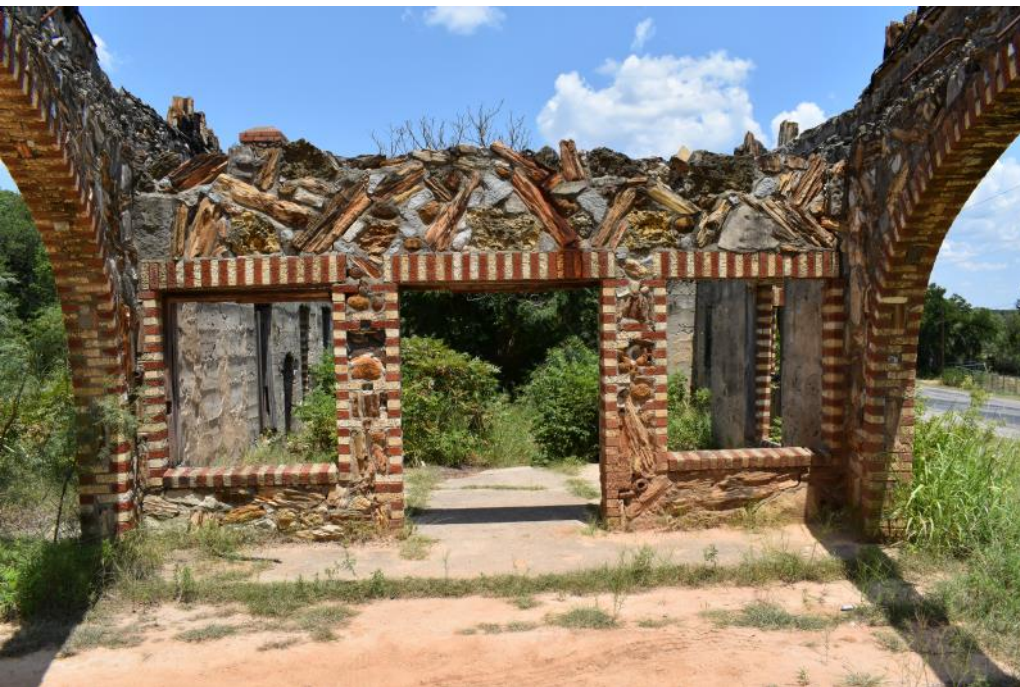
Front of the station past the cover.