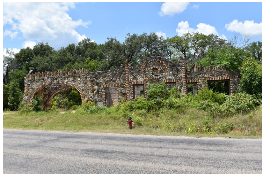
Looking from mostly the east.