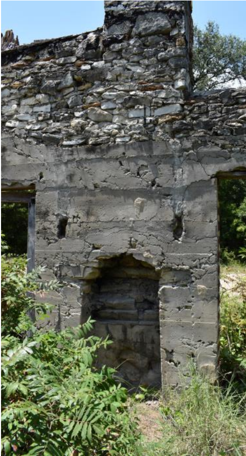
Here is what's left of the fireplace. It probably had more to it that is now long gone. The two indents above the arch were electrical outlets for wall sconces that likely was added when the building was electrified, probably after it was built.