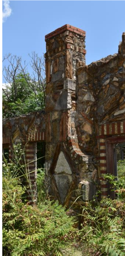
This is the outside of the same fireplace. Quite fancy!