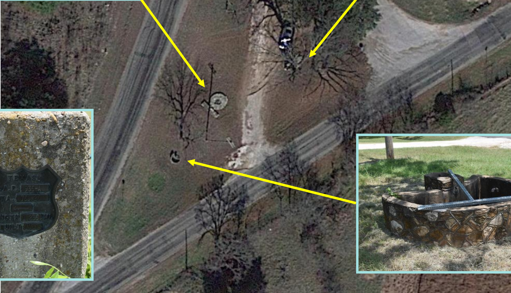
Some sort of fountain.