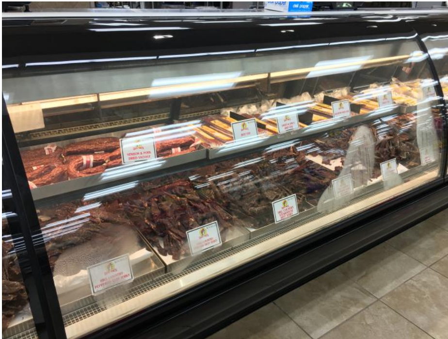
The jerky counter had four lengths of the above section!