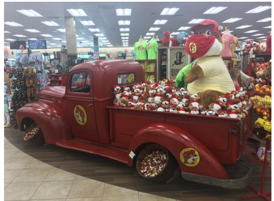
The store was impressive in visual interest and in variety of items.