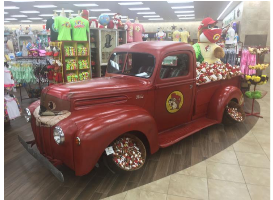
Neat old truck full of stuffed Buc-ees!