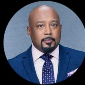
Daymond John Shark