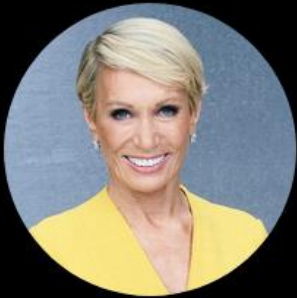
Barbara Corcoran Shark