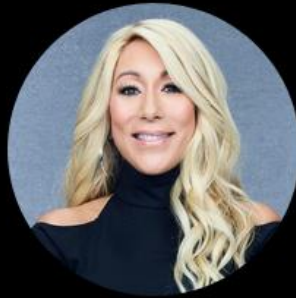
Lori Greiner Shark