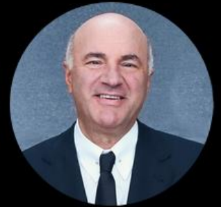
Kevin O'Leary Shark