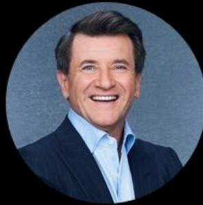
Robert Herjavec Shark