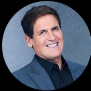
Mark Cuban Shark