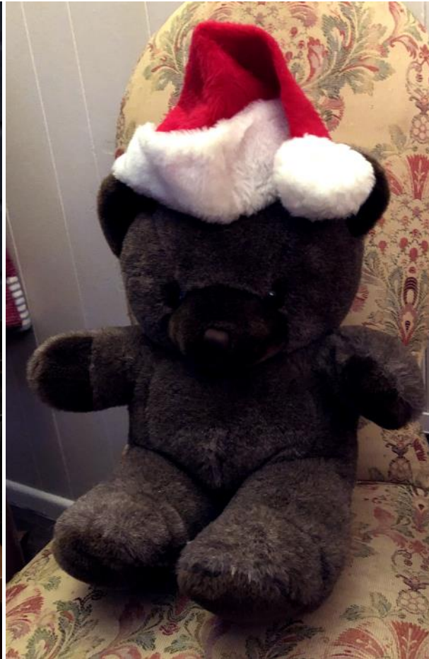
The teddy bear says have a nice winter hibernation!