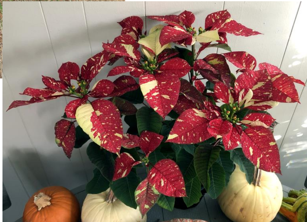
My poinsettia this year with really cool coloring!