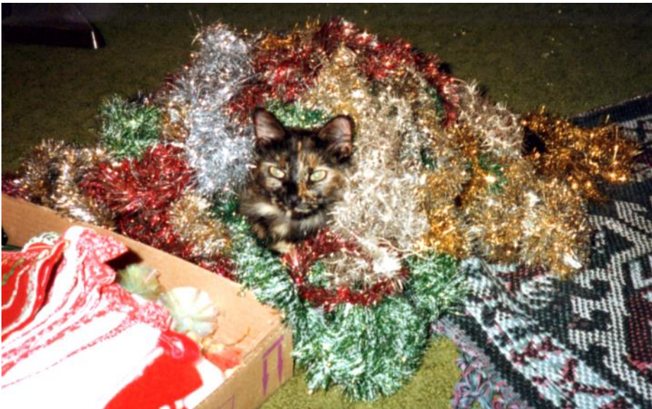
Circa early 2000s, Kittea-Kittea, Mom's cat