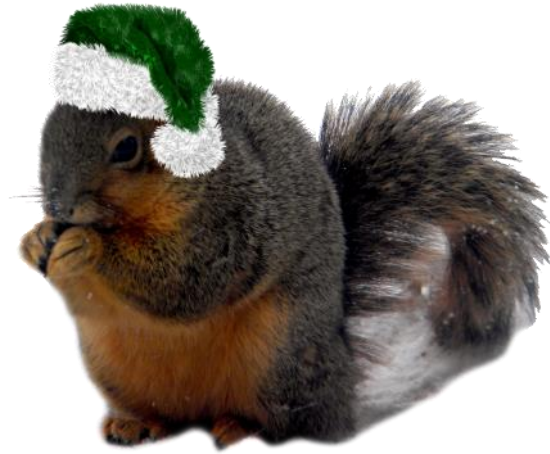
Can't forget the squirrels from Dad's house! (2013)