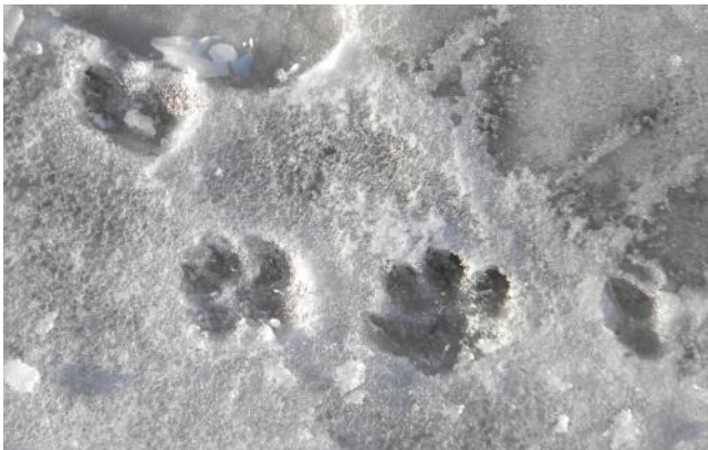
Dog paw prints from the Lubbock blizzard of 2016.