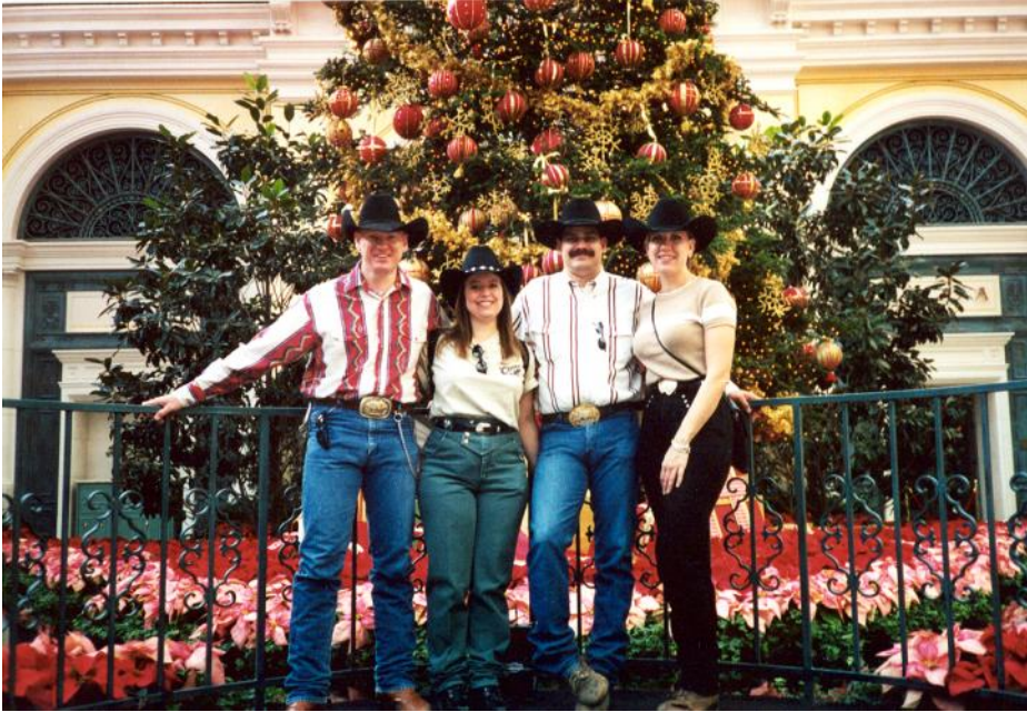
2000, Bellagio Hotel in Las Vegas while at the NFR.