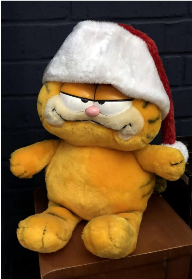
Garfield says Merry Christmas and to give him some lasagna!