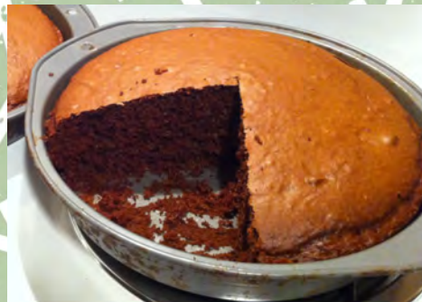
June—Box chocolate cake (10k feet)