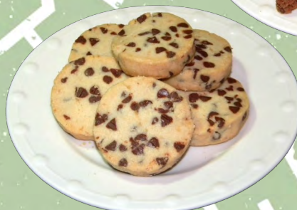
December—Chocolate chip shortbread cookies