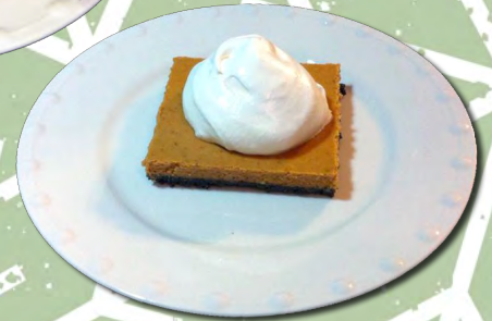
December—Pumpkin cream cheese pie