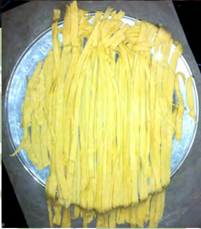
January—Homemade egg noodles