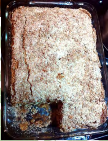
February—Sour cream coffee cake