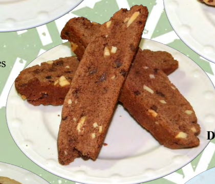
December—Chocolate almond biscotti