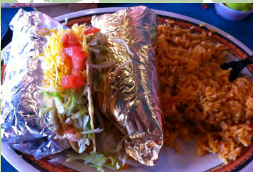
July—Rosa's Café Taco Tuesday and chocolate cake! (not homemade, of course)