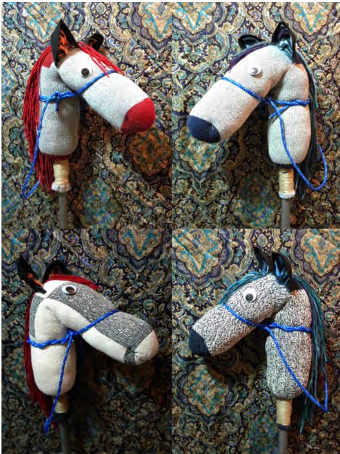
My newest craft project, stick horses! Shown here, I have red roan, blue roan, cremello, and flaxen! They are about 4' tall, and I am selling these for $25. These would make a great gift! (I'm still trying to figure out how to ship them.)

New Campaign! Help send RG to England for a museum studies summer program in 2014!