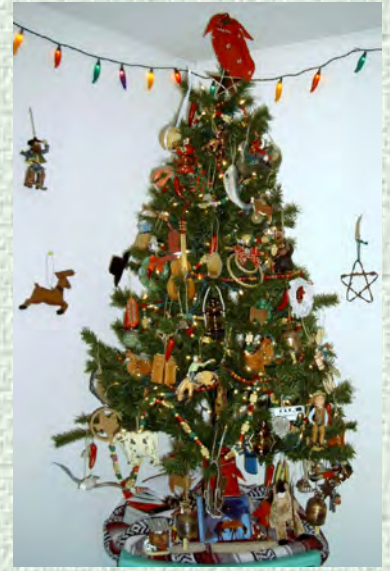
In 2005, I was living with some friends, and I set up this small artificial tree in my room. ☞