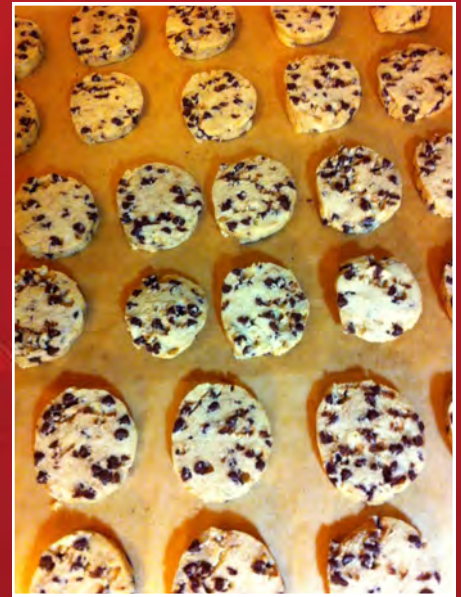
Chocolate Chip Shortbread