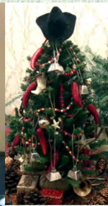
☞ In 2010, I moved into a duplex in early December. After getting a good deal at Lowe's, I bought two trees! (one in the living room and one in the bedroom.) Also, I set up a small tree on the table. The bedroom tree had my first strings of LED lights.