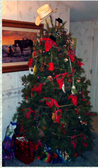
☞ This was my Christmas tree in 2003. I was living in a trailer in Posey, Texas near Slaton, Texas southeast of Lubbock. This was around the time I graduated from Texas Tech.

Christmas comes every year, and so we sometimes wonder what we did in years past for Christmas. So, here are a few photos of my past Christmases! (See if you can spot some of the reoccurring ornaments throughout the years.)